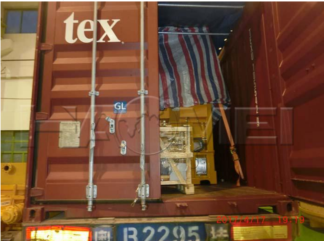
internationally renowned manufacturer of concrete mixers.